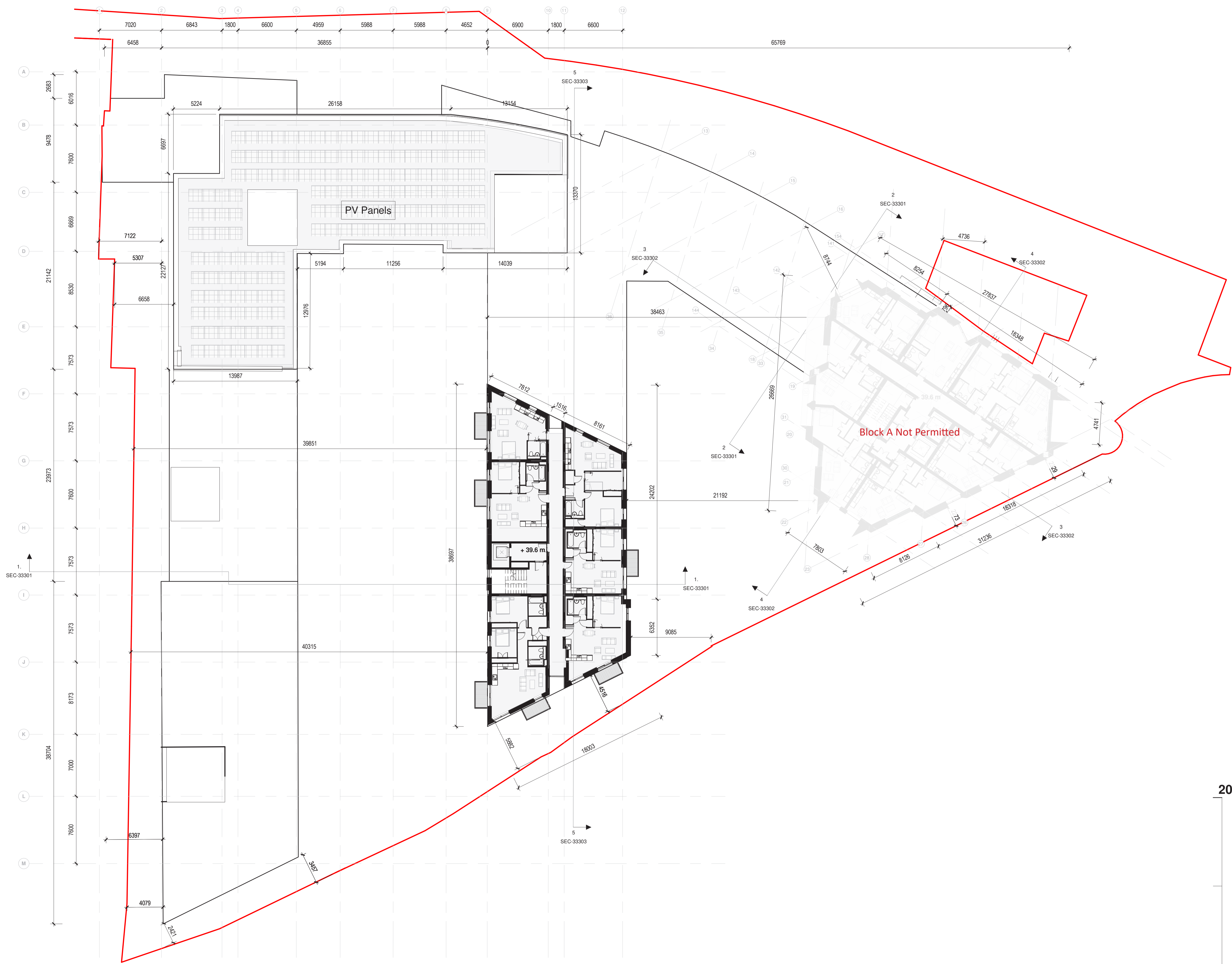
Proposed 10th Floor Plan 1 : 200

Notes: DO NOT SCALE FROM THIS DRAWING. USE FIGURED DIMENSIONS IN ALL CASES. VERIFY DIMENSIONS ON SITE AND REPORT ANY DISCREPANCIES TO THE ARCHITECTS IMMEDIATELY. THIS DRAWING TO BE READ IN CONJUNCTION WITH THE ARCHITECTS SPECIFICATION. © THIS DRAWING IS COPYRIGHT AND MAY ONLY BE REPRODUCED WITH THE ARCHITECTS PERMISSION.